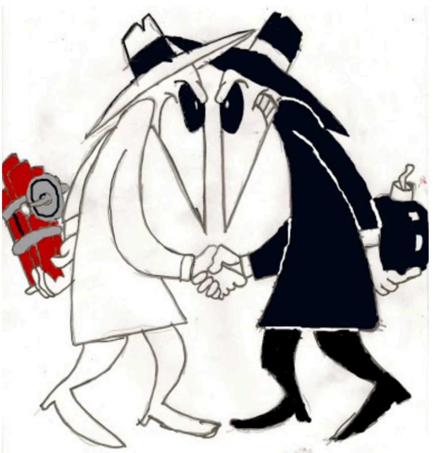
Spy Vs. Spy

So, for Facebook in China, exactly who is watching who here?